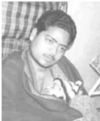
Father providing KMC

A comfortable chair with adjustable back may be useful to provide KMC during sleep and rest. In the KMC ward or at home, the mother can sleep with the baby in kangaroo position in a reclined or semirecumbent position, about 45° from above the ground. This can be achieved with an adjustable bed or with several pillows on an ordinary bed. It has been observed that this position decreases the risk of apnea in the baby. A supporting garment to carry the baby in kangaroo position will allow the mother, the father or the relatives to sleep with the baby in that position.