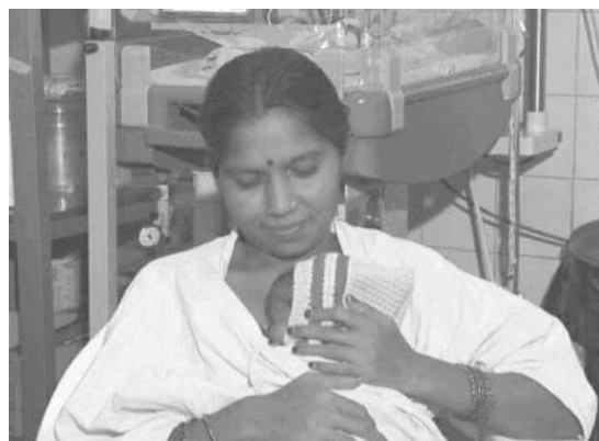
Baby upright between mother's breasts