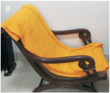
Figure 54.4: Mother practicing KMC in reclining posture (A) and KMC chair (B)